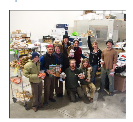
Farmers To You staff.

Since 2010, Farmers to You (FTY) has connected Vermont farmers with Boston-area families through weekly deliveries of food they order through the FTY website. FTY handles marketing, aggregation, and customer service so that farmers can focus on what they do best—growing quality food using sustainable, organic methods. FTY arranges pick-up, delivery and payment so that families can focus on what they need most—time to share quality food with each other. FTY currently delivers high quality, fresh food from Vermont (and some New Hampshire) farmers and value added food producers to an average of 400 families per