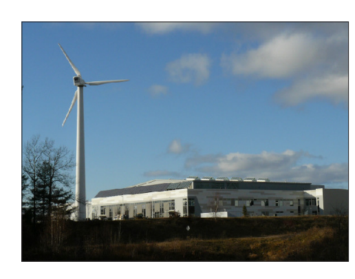
Wind turbine at Heritage Aviation.

The Flex Fund's investment was used to spin off the wind division of a Colorado based solar installation company into a new LLC—keeping 5 full time jobs in