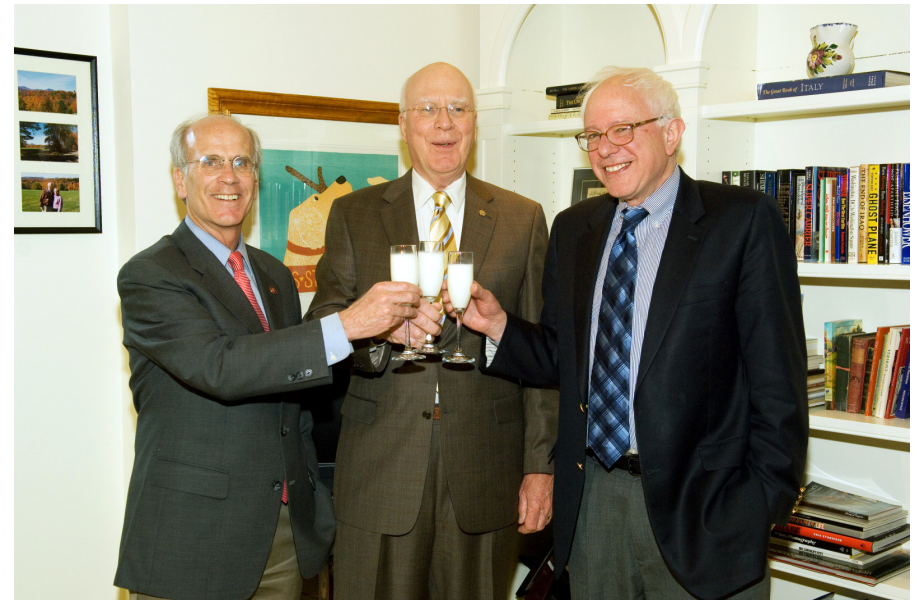
Congressman Peter Welch, Senator Patrick Leahy, and Senator Bernie Sanders at the traditional Milk Toast in celebration of the renewal of the Milk Income Loss Contract (MILC) Program's charter on May 22, 2008.

USDA programs now emphasize the "Know your Farmer. Know your Food" mission, and Vermonters, already known for their national leadership in this issue, stand ready to present a model that can be replicated throughout the country. Senators Leahy and Sanders and Congressman Welch have offered to help in any way they can, and their positions on key committees overseeing the FDA, USDA, DOE, and Federal Appropriations put them in a unique position to have a significant impact.