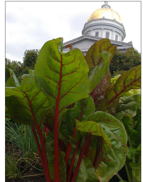
Chard growing in the State House garden

UVM Extension and VAAFAM conduct workshops and provide technical assistance to help farmers with farm transfer and risk management issues. Business advisors accessed through programs such as the Farm Viability Enhancement Program can help farmers think through the various legal structures for their businesses before seeking professional legal advice. The newly created Vermont Law Center for Agriculture and Food Systems at the Vermont Law School may also help